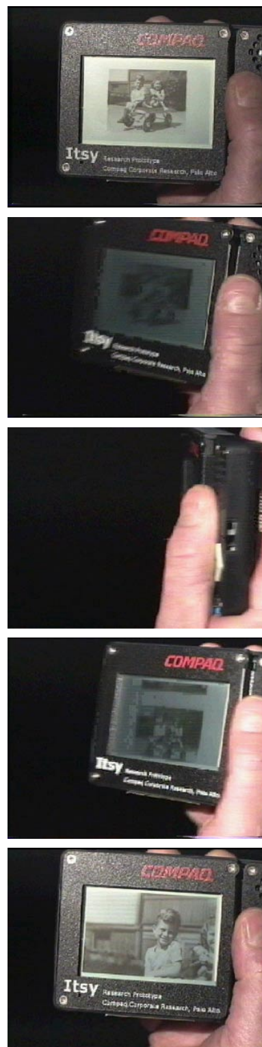
Figure 2: The first frame of the sequence (top-to-bottom) shows the thumbnail photo. In the next three frames, the user fans the device. The fifth frame displays the full-size picture.

Other possible command gestures include snapping or shaking the device, tapping on it with the other hand, or fanning it. Unlike Levin and Yarin's implementation[7], we rejected snapping and shaking the device because of the strain it places on the user's hand and wrist. The mass of a 4-to 6-ounce device proves sufficient to strain users when they repeatedly perform such a gesture. Tapping is attractive because it doesn't require users to move the device, but