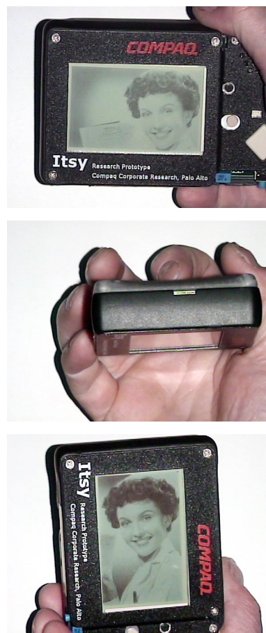
Figure 3: As shown in this sequence, the user positions the album in the desired orientation, then holds it for a couple of seconds to change the display from landscape to portrait mode.

With these design constraints in mind we chose a two-axis, single-chip accelerometer - Analog Devices'