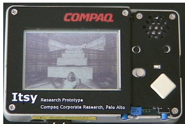
Figure 7: Doom on Itsy

down, they'd move up the stairs. Whether they sloshed the gun up the stairs or pointed to where they wanted the gun to go, the action and expected result were identical.