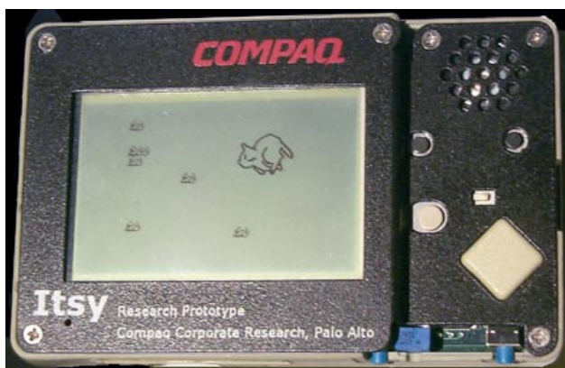
Figure 6: Cat and mouse game.

While most users had positive things to say about the Rock 'n' Scroll interface, they also noted some problems with the display while playing the game. The Itsy display is a reflective LCD, so ambient light conditions can cause significant changes in screen visibility as the device tilts. In addition, enthusiastic play often results in significant tilt that exceeds the viewing angle of the display. While LCD technology will improve and reduce these effects, some experienced users observed one display difficulty inherent in embodied user interfaces: perceived motion on the screen is the sum of the motion of the embodied device and