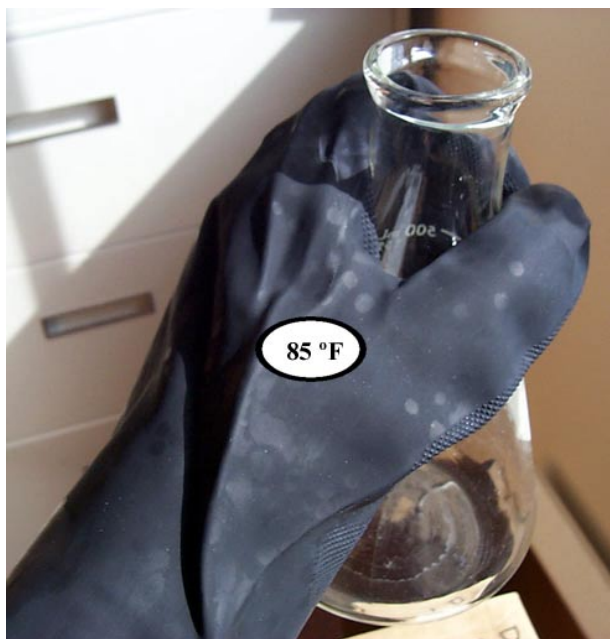
Figure 8: Industrial glove with hands-free thermometer (mock-up).

In the discussion to this point, users always held the device in either or both hands. However, since all interaction occurs by manipulating the device, it could also be worn. One promising area for wearing a small gesture-controlled device is on the “snuff box” portion of either hand - that is, the area between the thumb and index finger on the back of the hand. This area is typically visible when using your hands. Gestures can be made on either of the device’s axes by moving either your hand or forearm. Figure 8 shows how a thermometer that measures the temperature at the palm of the glove could be mounted. By gesturing, the user can change the display to show the minimum, maximum, or current temperature. Other gestures could be used to switch the scale between Fahrenheit and centigrade and clear the saved minimum and maximum values. While at first this might seem a contrived example, consider for a moment the difficulty of trying to push your watch’s buttons while you have gloves on.