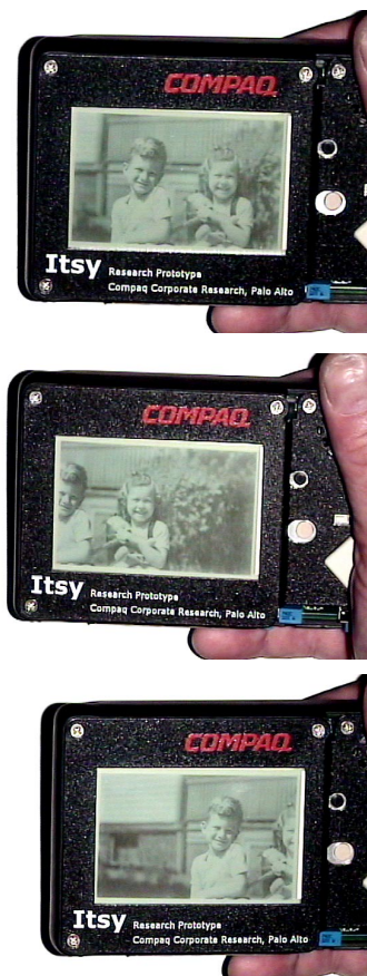
Figure 5: In the frame at the top, the picture is in the initial position. When the left edge of the device is dipped, seven of the fifteen subjects expected gravity to "slosh" the picture into the position it has in the center frame, and five of the fifteen subjects expected to see the picture like the bottom frame because they "pointed" with the left edge of the device to that corner of the picture.